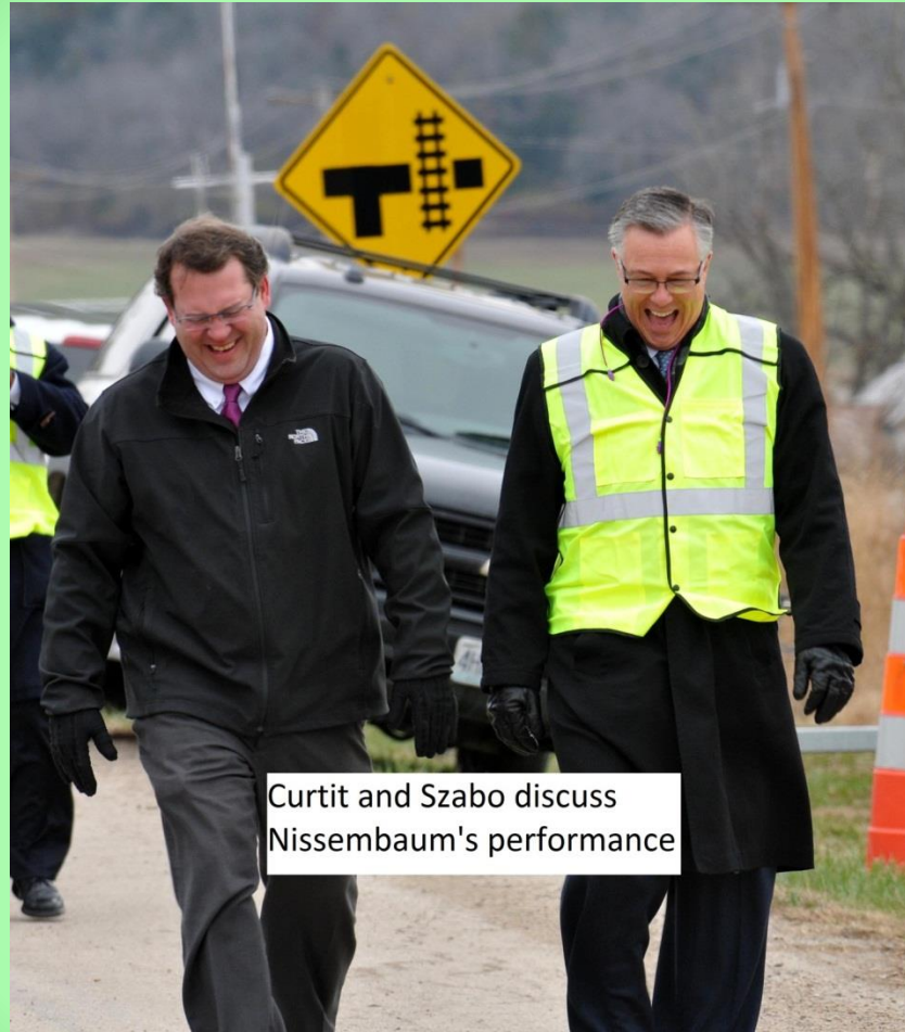
Curtit and Szabo discuss Nissebaum's performance